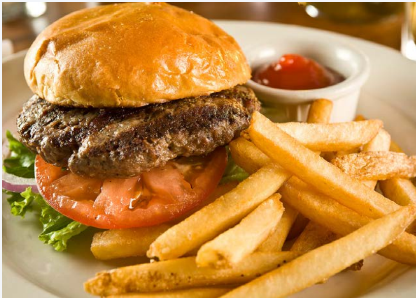
BURGER PLATTER BUFFET

Includes: mixed green salad, caesar salad, country potato salad, roasted potatoes in herbs and butter, steamed assorted vegetables, 8 oz. sirloin steak with red wine and mushroom au jus, fried onions, fried mushrooms, garlic toast, assorted desserts and coffee/tea