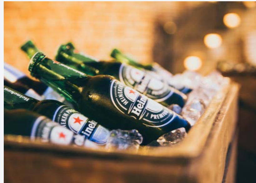
DOMESTIC & HIGH BALLS

One hot dog or sandwich per person. Prices are subject to change. Taxes and gratuities are not included.