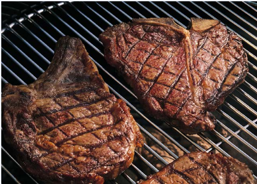
CLASSIC STEAK BUFFET

Includes: mixed green salad, caesar salad, greek pasta salad, roasted potatoes in herbs and butter, steamed assorted vegetables, fresh dinner rolls with butter, roast beef with au jus, vegetarian lasagna, assorted desserts and coffee/tea