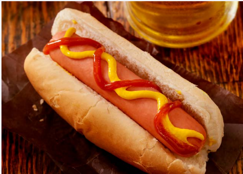
BEER & HOT DOG COMBO

Includes: caesar salad, country potato salad, beef and veggie burgers, mushrooms, cheese, onions, unlimited french fries, assorted desserts and coffee/tea