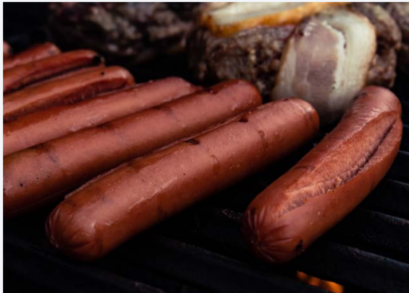
HOT DOG / SANDWICH